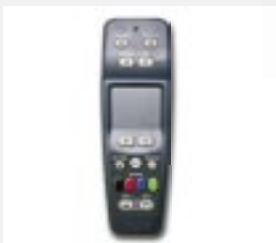
Present anywhere in the room via remote control