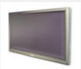
Attaches to flat panels from 37" to 63"