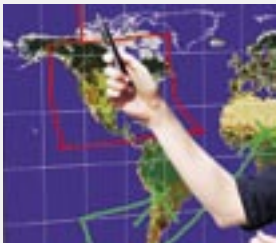
Highlight key points right on the flat-screen display