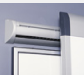
Power and Data Track *