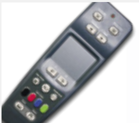
Intuitive Remote Control