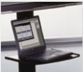
Optional Stand and PC Tray