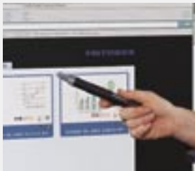
Electronic Pen Turns into a Fully Functional PC Mouse