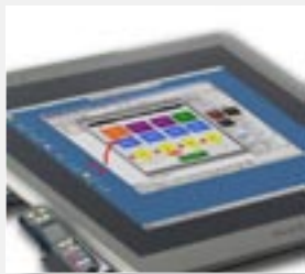
Walk-and-Talk Interactive Panel