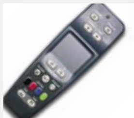
Engage your audience and control all panel applications with the remote control