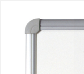
Satin finish aluminum frame