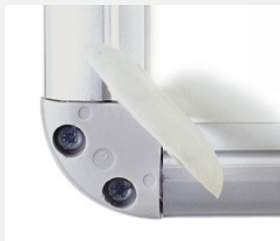
Unique mounting system for easy installation