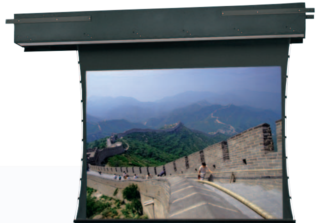
All fabrics will be seamless.

Doors can be finished by the contractor to match ceiling for a professional look.