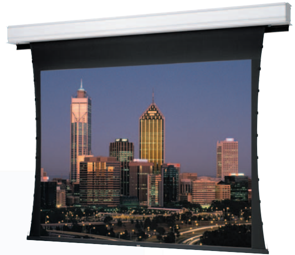
All fabrics will be seamless.

Dual motors with one operating the door and one operating the screen.