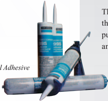
Silicone Structural Adhesive